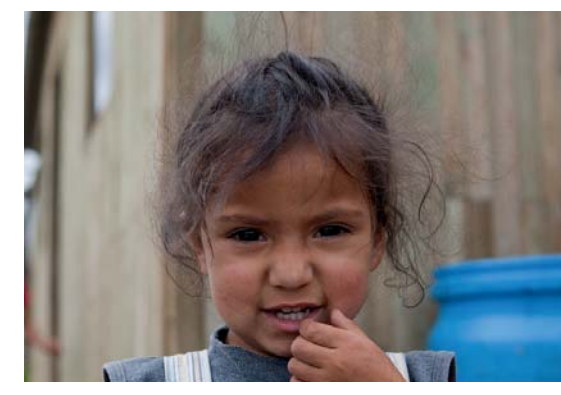
One of more than 80 children who are excited about the newly constructed houses.

"MIT is a very important program which has been supporting beautiful initiatives and the engagement of our employees over the years."