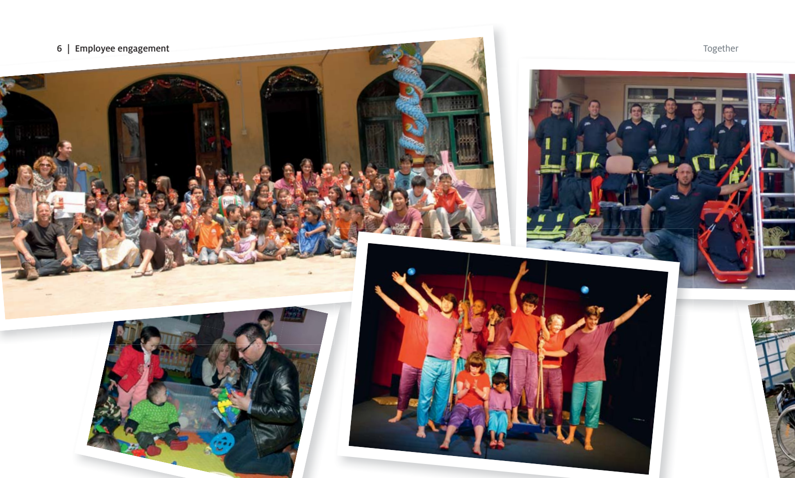
Here you can see examples of the broad spectrum of engagement shown by Henkel employees and retirees. On the following pages, you can read the stories that go with these photos.