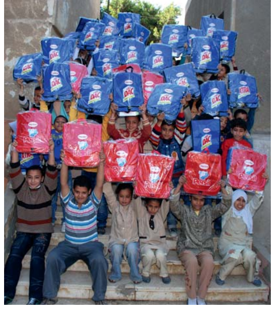
Again in 2012, many Egyptian school children are thrilled with their Henkel schoolbags containing useful materials for writing, learning and handicrafts.