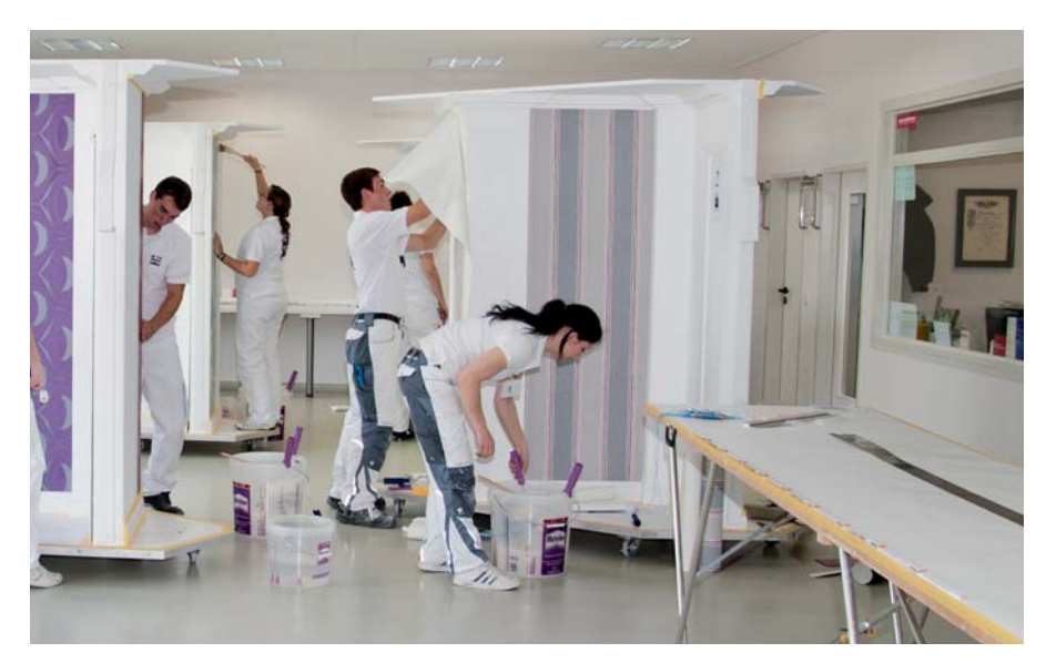
Future master craftsmen in the practical test: In only two and a half hours, two different types of wallpaper had to be selected and correctly hung. Not only the technical ability of the ten participants was important in the "Quality Makes Masters" competition, but also their creativity.