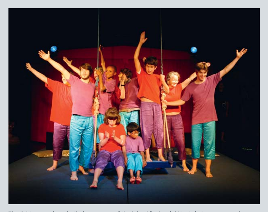
The tightrope and acrobatic dance group of the School for Special Needs in Lucerne earned a standing ovation from the audience.