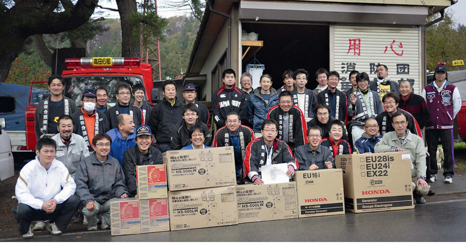
Members of the fire department in Rikuzen-Takada, Iwate Prefecture, in Japan, with its new electricity generators, floodlights, and cable drums for emergency response preparedness. This equipment was acquired with donations from the Henkel fire department in Düsseldorf, Germany.