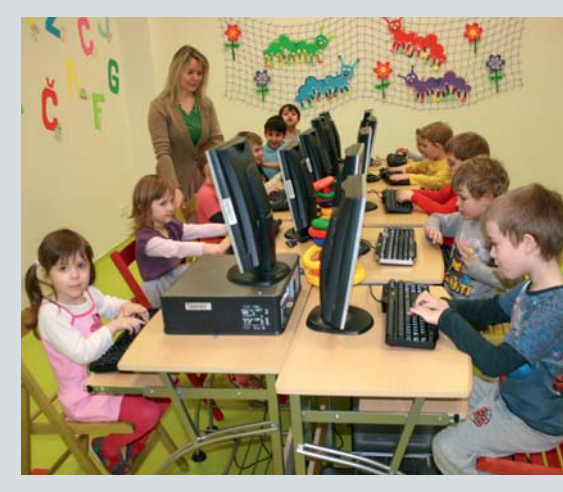
The little ones are not only highly motivated, but have plenty of fun learning the basics of their language in the new computer room at the Havířovská Nursery School in Prague.