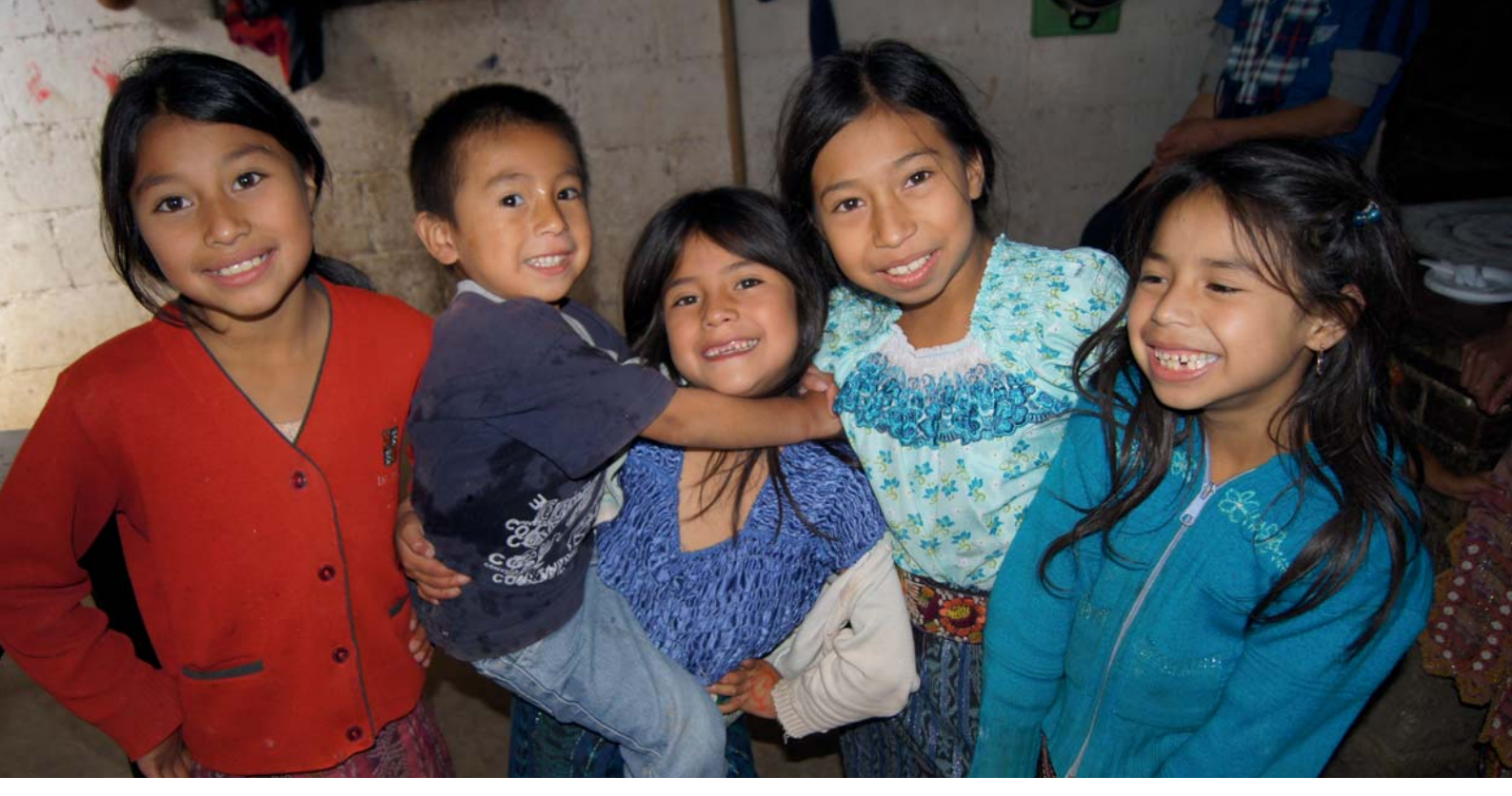
The children in the Guatemalan village can have greater hopes for their future due to better education and medical care.