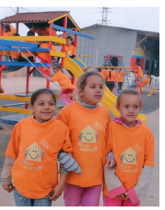
The children can have fun playing in the safe, newly designed playground.