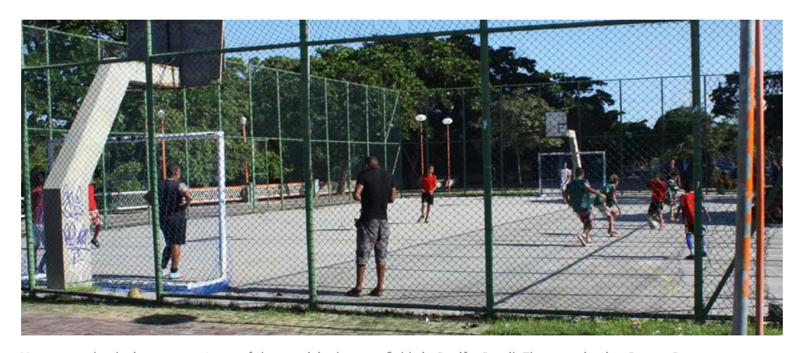
Young people playing soccer at one of the municipal soccer fields in Recife, Brazil. The organization Ruas e Praças sponsors this recreational opportunity, to integrate street children into society through sport.