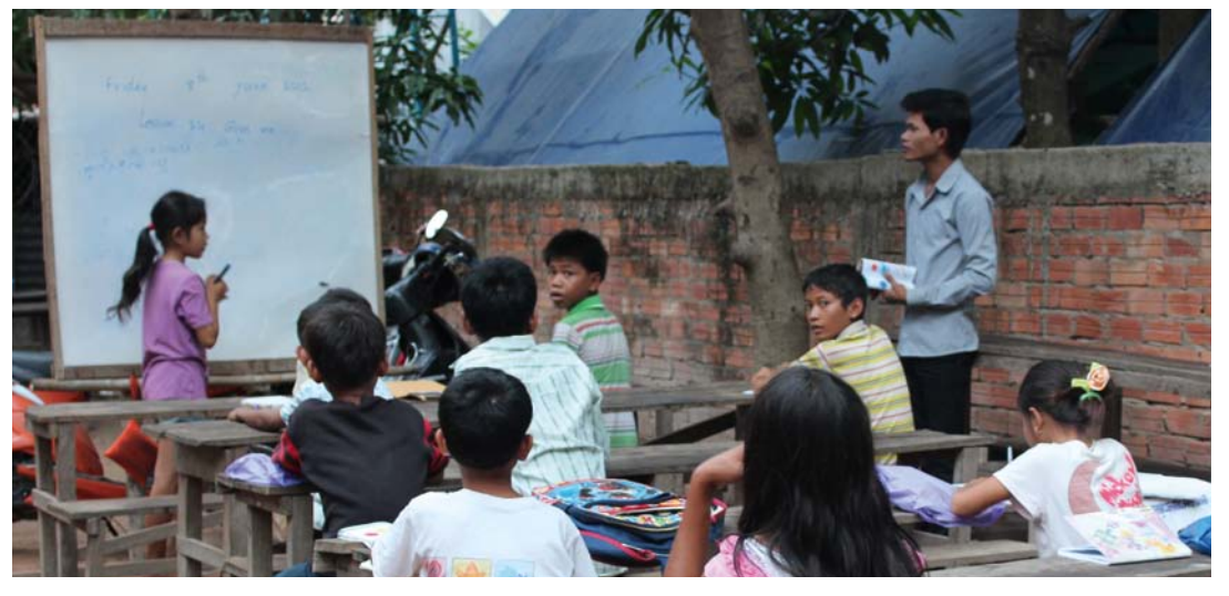
Lessons in the "Khmer For Khmer Organization" (KFKO) children's home in Siem Reap, Cambodia.