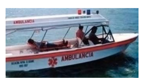
MIT support is to improve first aid on the Cimitarra River in Colombia.

"The river landscape in the Valle del Rio Cimitarra in the western part of Colombia is beautiful, but life here is no paradise," explains Greys Suarez. Alongside