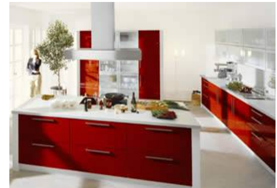
Kitchen with high gloss surface