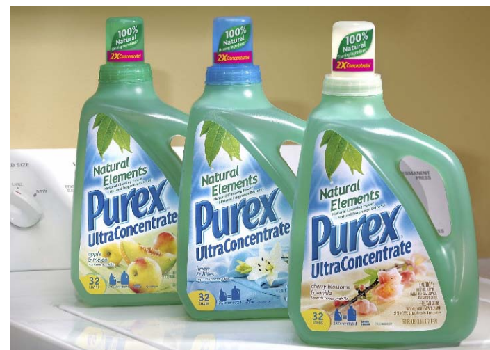
Linen & Lilies