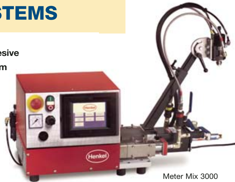
Meter Mix 3000

Versatile dispensing systems for two-part adhesive chemistries incorporate a variety of feed system options. Available in fixed or variable ratio, the systems offer programmable shot size and integrated PLC controls with convenient touch screen capability. These units come standard with mild steel pump components with optional abrasion resistant or 304 stainless steel.