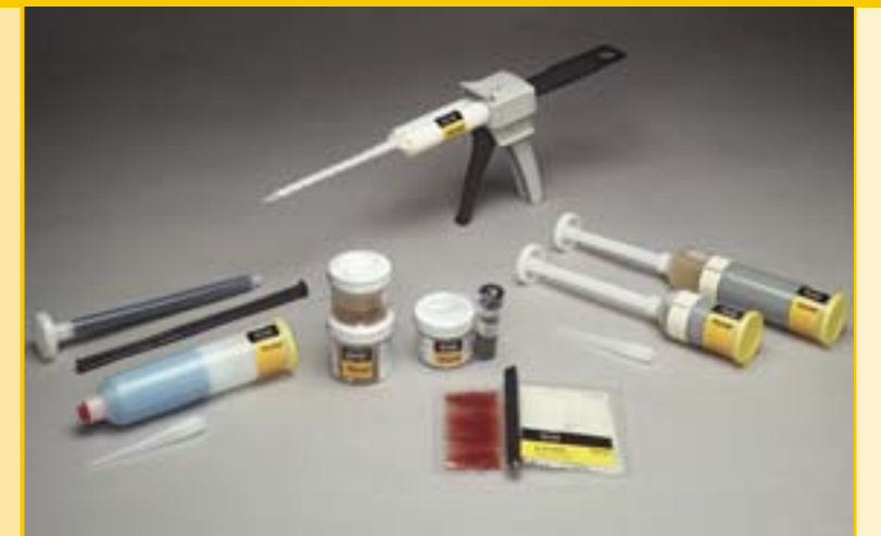
Direct from the factory premeasured packaging.