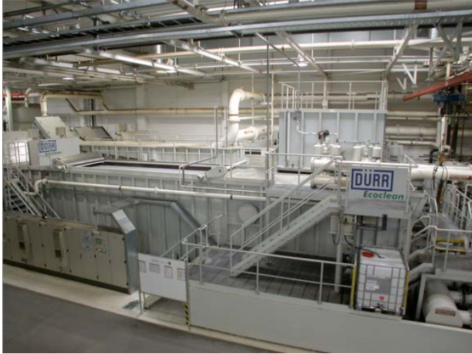
The Skoda's Mlada Boleslav plant contains the largest lubricoolant system in the Czech Republic. The facility supplies the engine production shop.