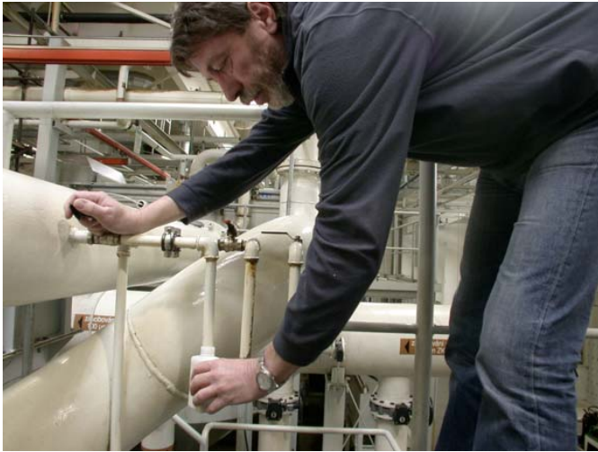
The emulsion is highly stable, as confirmed by the analyses performed in regular sampling operations.