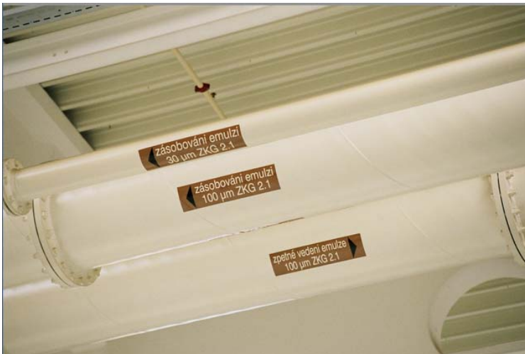
An impressive system of pipework and conduits guides the lubricoolant to the machining centers in the production bays.