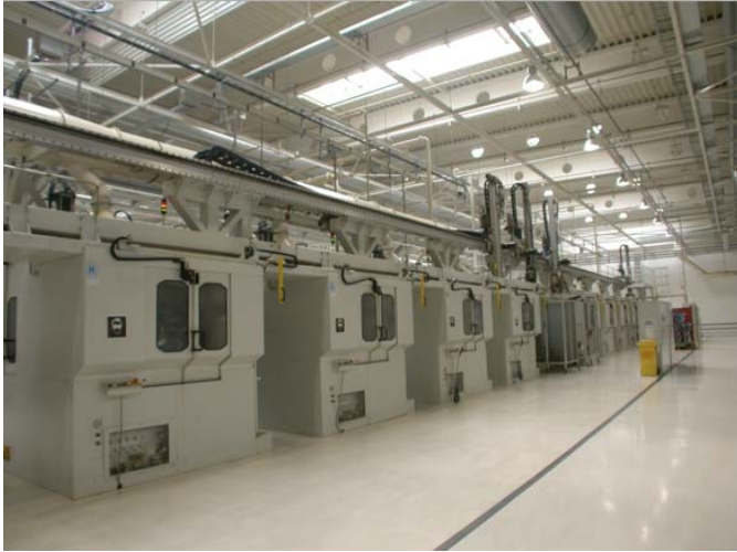
The machining line for the engine cases extends over a distance in excess of 200 meters.