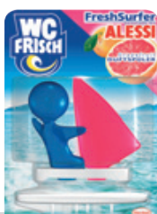
WC Frisch FreshSurfer