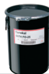
Terokal 5074: crash-resistant structural adhesive