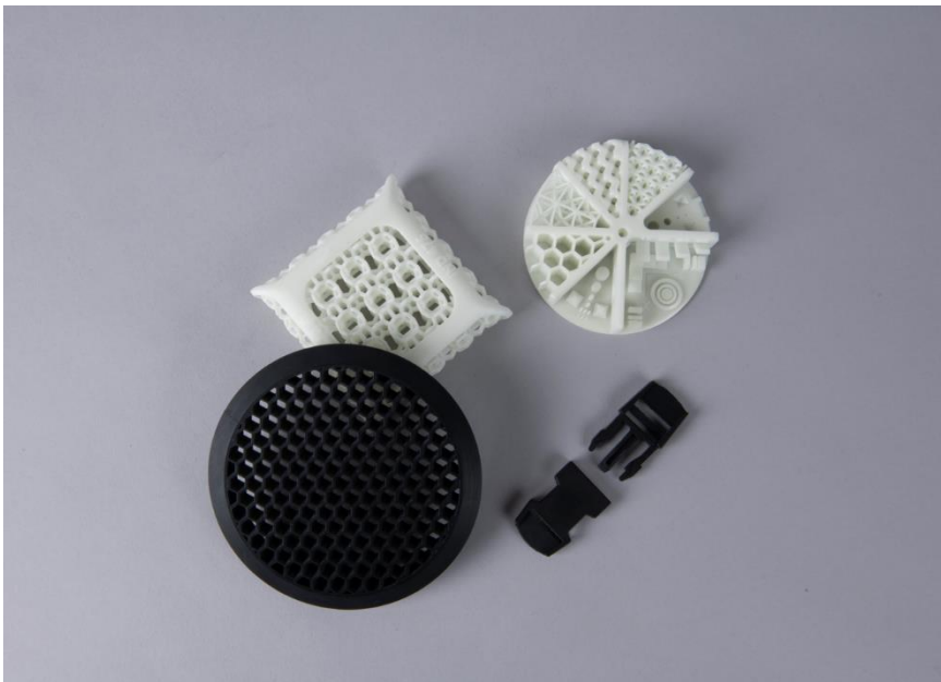
Part samples in Loctite IND 475 and Loctite 3843 printed with Prodway's ProMaker LD 3D printer.