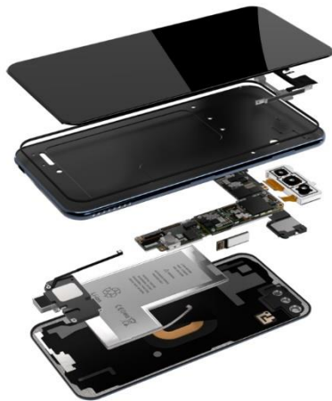
Henkel will specifically highlight pad printing and antenna technologies, for example for housings of smartphones.