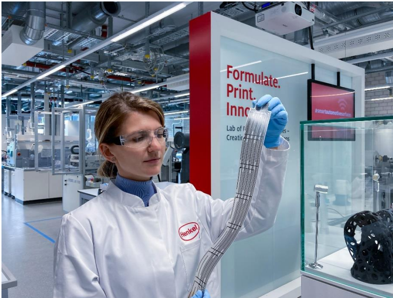
Henkel presents innovative printed electronics solutions for smart surfaces and digital healthcare at LOPEC 2023.