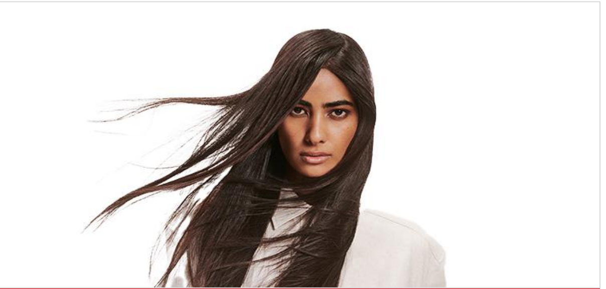
CONSUMER BRANDS – Hair category

LOCTITE TECHNOMELT BONDERITE AQUENCE. TEROSON.