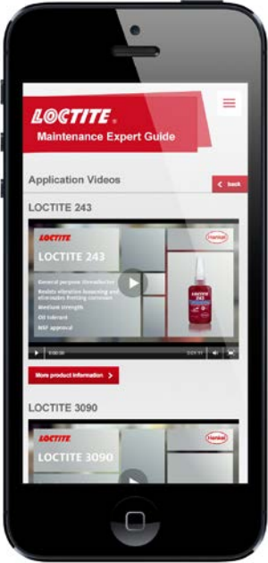
The Loctite Maintenance Expert Guide.

QR code for accessing the mobile Loctite® Mobile Maintenance Expert Guide. Alternatively, users can enter the following URL: www.loctite-maintenance.co.uk/en/maintenance-expert-guide.html