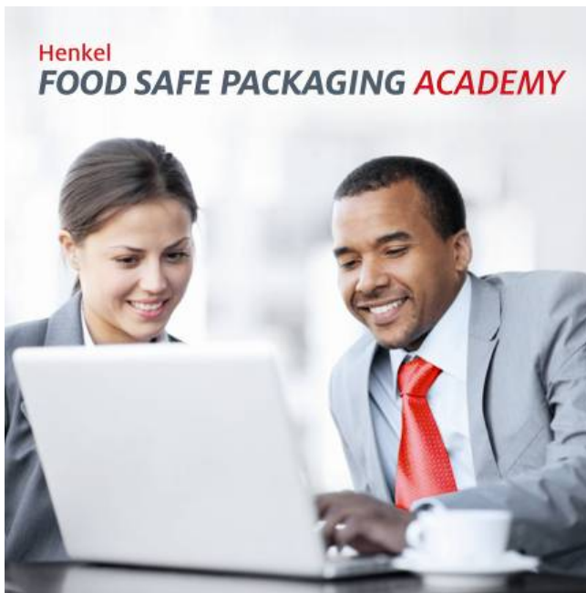
Henkel's new Food Safe Packaging Academy.