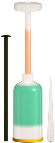
Henkel offers different Ready-to-use Packaging Solutions: Injection Cartridge Kit.