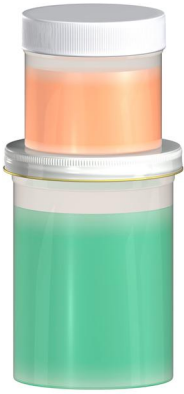
Henkel offers different Ready-to-use Packaging Solutions: Pudding Cup.