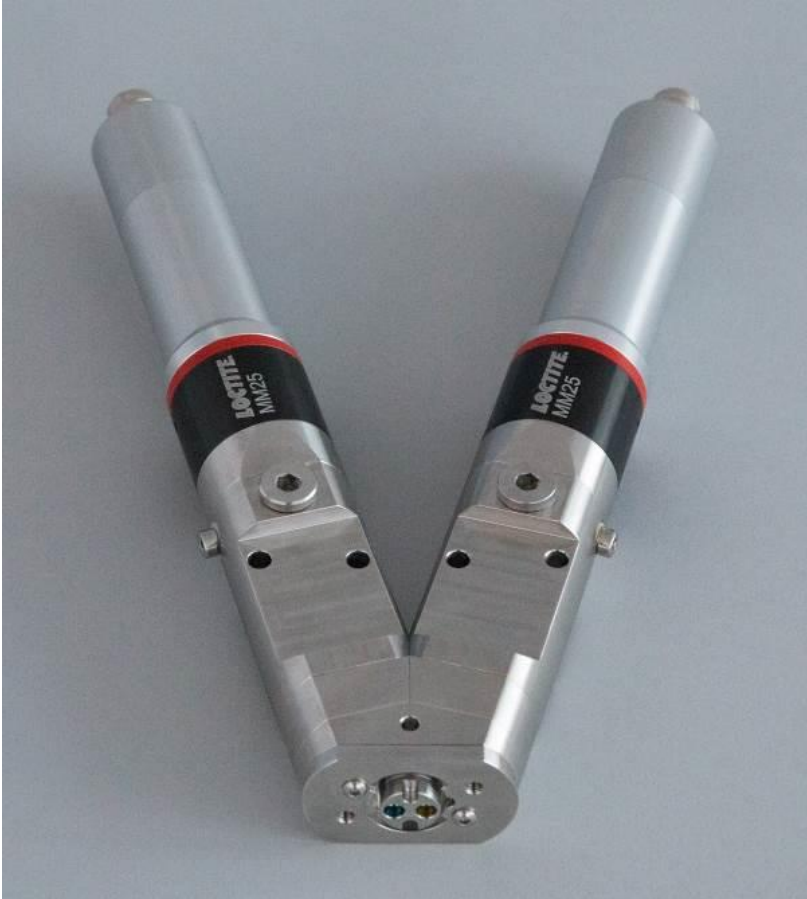
MM25 Dual Rotor Pump as close-up