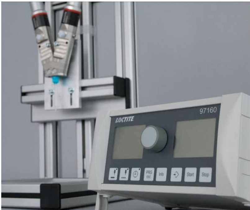
Dual rotor pump controller Loctite 97160