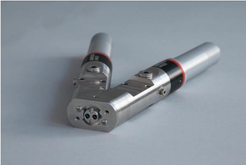
MM25 Dual Rotor Pump