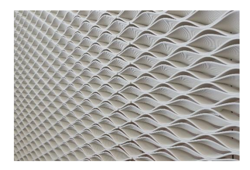
The 3D Printed wall in the Henkel Innovation and Interaction Centre, made from Loctite products and designed by Jennings Design Studio, Dublin and Aectual, Netherlands.

Henkel offers end-to-end solutions for 3D Printing enabling the final parts production across various industries.