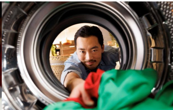
LAUNDRY & HOME CARE